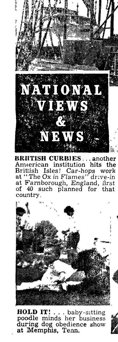
HOLD IT!... baby-sitting, poodle minds her business during the audience show at Memphis, Tenn.